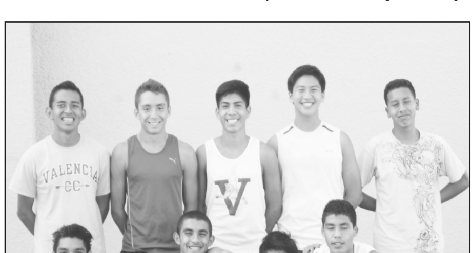
Boys Cross Country Team Poses for Camera